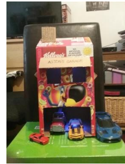
Aston Division 14 "Not-A-Box" Garage